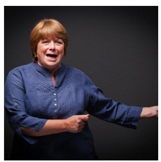
be fully inclusive.

I believe passionately that singing and music should